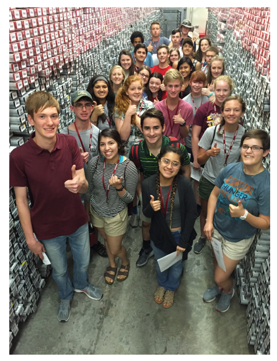
2016 TAMU GeoX camp touring the GCR.

The annual Scientific Ocean Drilling Bibliographic Database Report documents how postexpedition Program-related research is disseminated into the scientific community through publications. The 2016