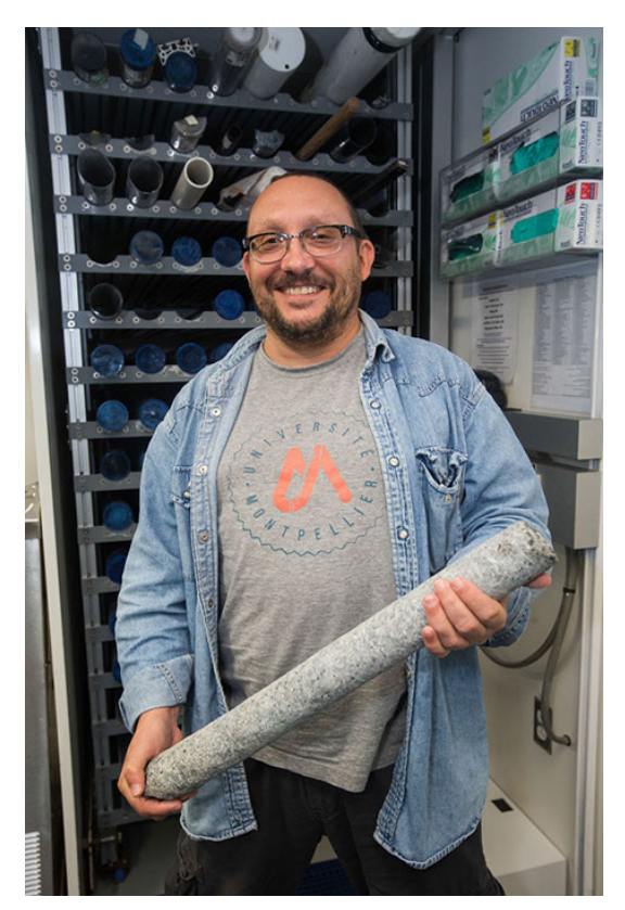
Expedition 360 scientist holding core fresh from the drill floor.

previous ODP holes: Hole 735B (drilled during Leg 118 in 1987 and Leg 176 in 1997) and Hole 1105A (drilled during Leg 179 in 1998). A mantle peridotite/gabbro contact was traced by dredging and diving along the transform wall for 40 km. The contact is located at ~4,200 m depth at the drill sites but shoals considerably 20 km to the south, where it was observed in outcrop at 2,563 m depth. Moho reflections have been found, however, at ~5–6 km beneath Atlantis Bank and <4 km beneath the transform wall, leading to the suggestion that the seismic discontinuity may not represent the crust/mantle boundary but rather an alteration (serpentinization) front. This suggestion raises the interesting possibility that a whole new planetary biosphere may thrive due to methanogenesis associated with serpentinization. The SloMo Project seeks to test the two hypotheses for the Moho reflections at Atlantis Bank and evaluate carbon sequestration in the lower crust and uppermost mantle.