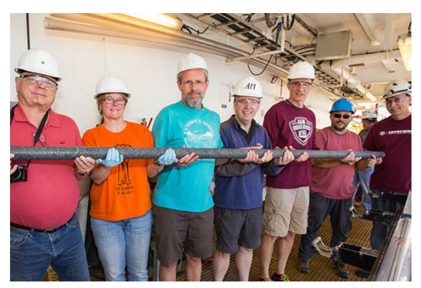
Expedition 360 scientists holding record-length Expedition 360 core.

Expedition 362 drilled into the Indian oceanic plate to collect input materials of the North Sumatran subduction zone, the origin of the 2004 earthquake and tsunami in the Indian Ocean region, and examine the role of