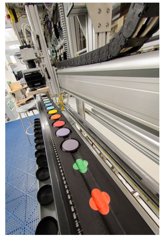
RGB color calibration standards on the Section Half Image Logger.

The 360 Degree Images to LIMS project improved support for capture, retrieval, and management of Whole-Round Line Scan (WRLS) images and their composites. Successful integration entailed revisions to data storage definitions, LIMS Reports, the data upload facility, and the Section Half Image Logger (SHIL).