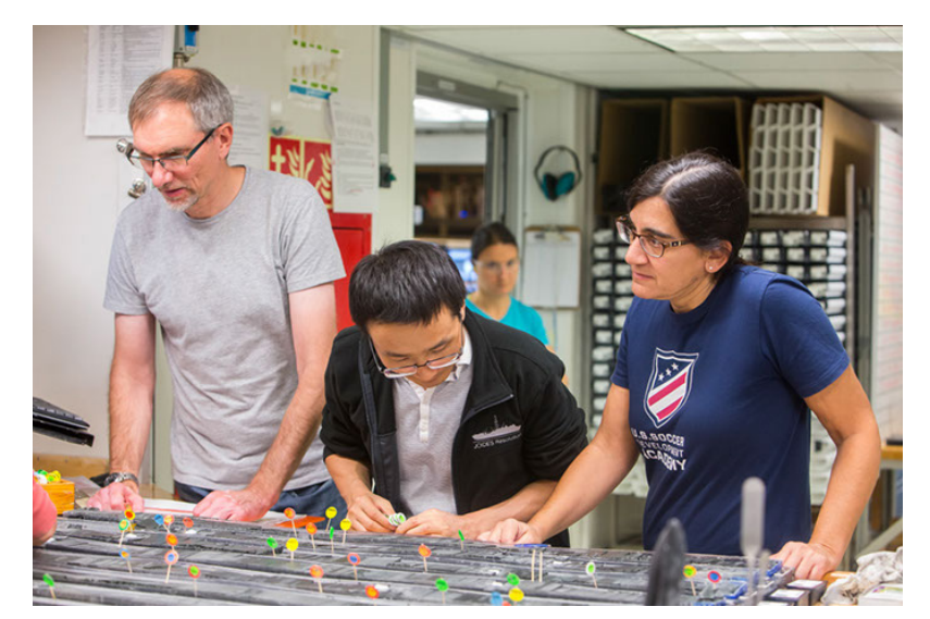
Expedition 362 scientists at the sampling table.

During Expedition 362, two sites on the Indian oceanic plate ~250 km southwest of the subduction zone, Sites U1480 and U1481, were drilled, cored, and logged to a maximum depth of 1,500 mbsf. The sediment/rocks that will develop into the plate boundary detachment and drive growth of the forearc were sampled, and their progressive mechanical,