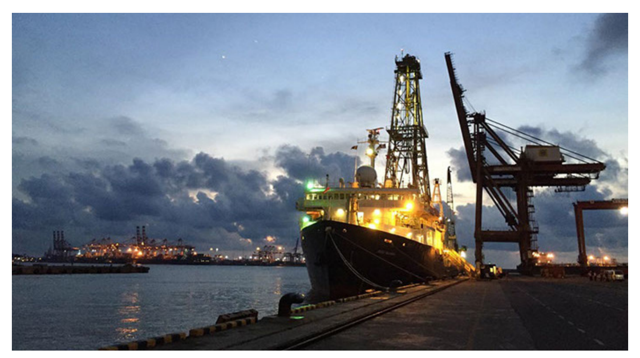
The JOIDES Resolution docked in Colombo, Sri Lanka.

IODP facilities are funded by three platform providers (the US National Science Foundation [NSF], Japan's Ministry of Education, Culture, Sports, Science and Technology [MEXT], and ECORD) with financial contributions from the People's Republic of China Ministry of Science and Technology (MOST); the Coordination for Improvement of Higher Education, Brazil; the Interim Asian Consortium, represented by the Korea Institute of Geoscience and Mineral Resources (KIGAM); the Australian and New Zealand IODP Consortium (ANZIC) funded by the Australian Research Council (ARC) and GNS Science (New Zealand); and the Ministry of Earth Sciences (MOES), India. Together, these agencies represent 26 participating nations whose scientists are selected to staff IODP research expeditions conducted throughout the world's oceans.