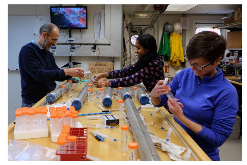
Expedition 361 scientists collecting Rhizon samples from the core.

Cape Basin, were targeted to reconstruct the history of the greater Agulhas Current system over the past ~5 My. The Agulhas Current is the strongest western boundary current in the Southern Hemisphere, transporting some 70 Sv of warm, saline surface water from the tropical Indian Ocean along the East African margin to the tip of Africa. Exchanges of heat and moisture with the atmosphere influence southern African climates, including individual