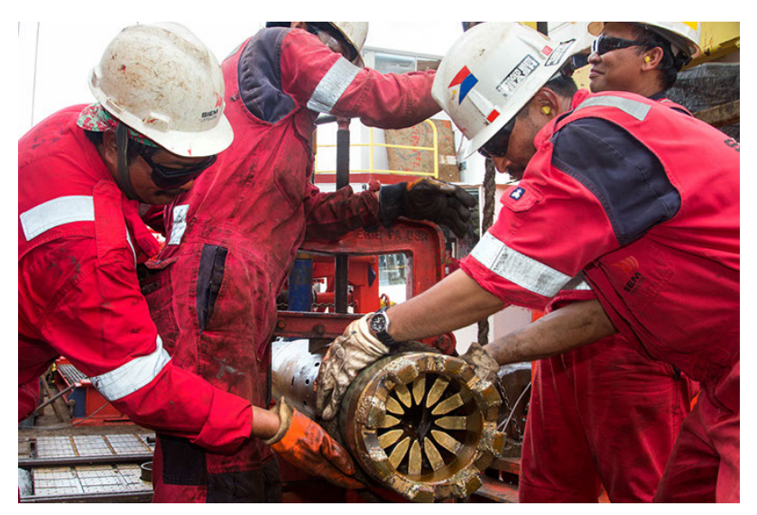
Siem Offshore crew pulling core from the drill pipe.

The review panel recommended an increase in community participation in the Laboratory Working Groups (LWGs) and the visibility of LWG activities to