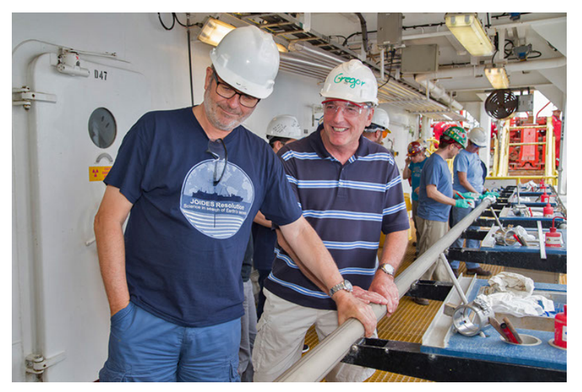
Expedition 359 Co-Chief Scientists with the first core on the catwalk.

The expedition had two main objectives. The first was to date precisely the onset of the current system that is potentially in concert with the onset or the intensification of the Indian monsoon and coincides with the onset of the modern current system in the world's ocean. The second was groundtruthing the