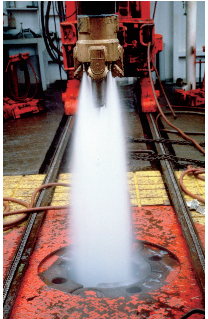
Rig floor flow test of MDCB.

With the addition of a latch sub, the MDCB can utilize the same BHA as the APC and XCB. Eliminates extra pipe trips to change the BHA.